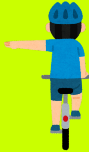
Left Turn Signal

Hand signals tell others around you what your intentions are.