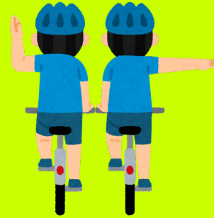
Right Turn Signal